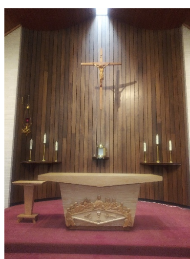
Good Friday 2023