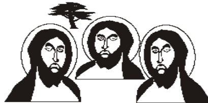
The Lord Appeared To Abraham