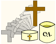
Sacrament of Anointing