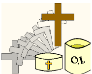
Sacrament of Anointing