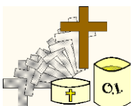
Sacrament of Anointing