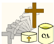
Sacrament of Anointing